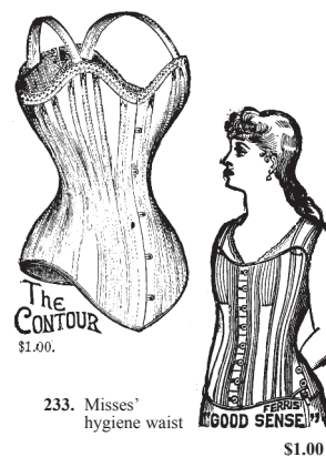
The Contour $1.00.