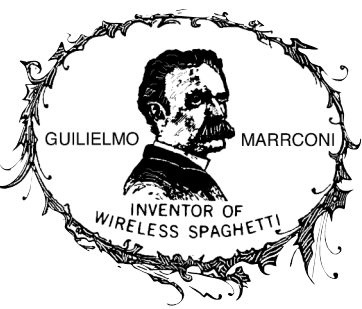
GUGLIELMO MARRCONI INVENTOR OF WIRELESS SPAGHETTI