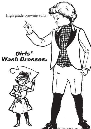
High grade brownie suits