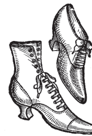
245. Genuine oiled pebble leather . . $1.40