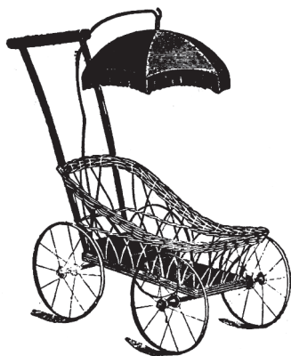
M9 — Better constructed carriages; parasol, lined, etc. .... $3.00, $3.25, $3.75, $4.00