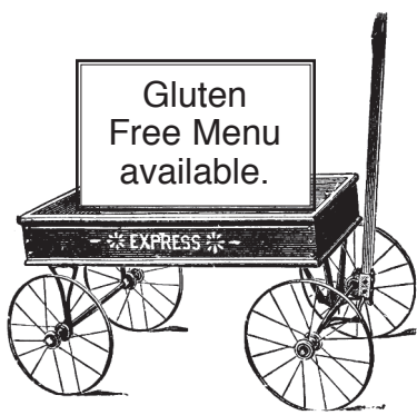
T6 — Wood box wagons ..... $2.75, $3.50